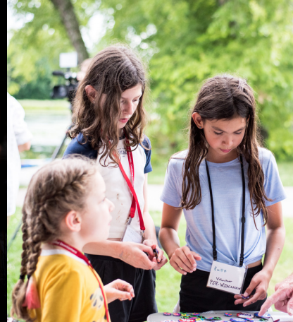
Photos from the 2022 Lanterns for Peace event.